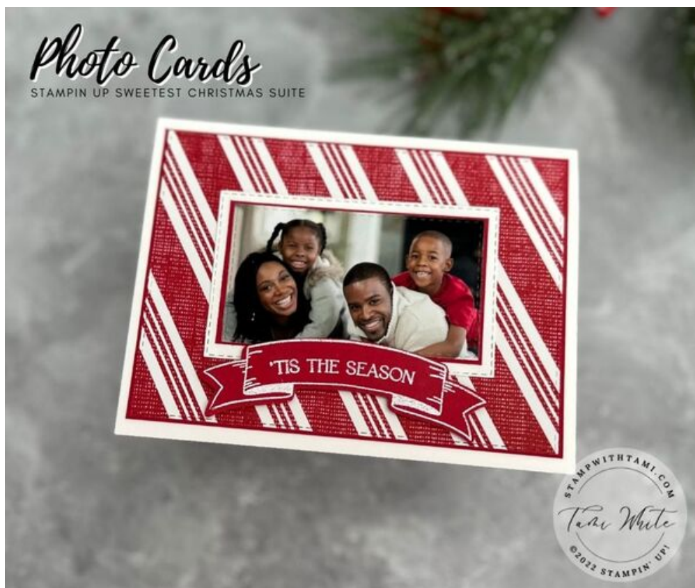
Cards 1 in my series of Holiday Photo Cards.

Tami White tami@stampwithtami.com www.stampwithtami.com