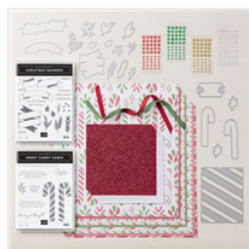
Sweetest Christmas Suite Collection (English) - 159579

Tami White tami@stampwithtami.com www.stampwithtami.com