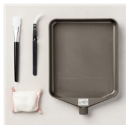
Embossing Additions Tool Kit - 159971