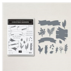
Christmas Banners Bundle (English) - 159993