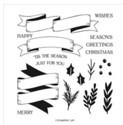
Christmas Banners Photopolymer Stamp Set (English) - 159570