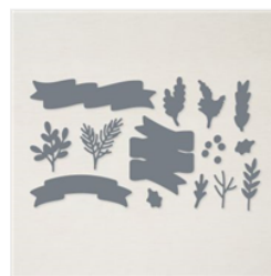
Christmas Banner Dies - 159576