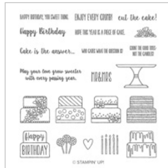
Piece Of Cake Photopolymer Stamp Set