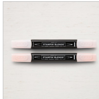
Petal Pink Stampin' Blends Markers Combo Pack 147272