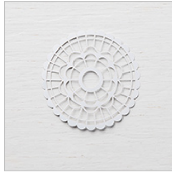
Pearlized Doilies 146936