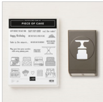
Piece Of Cake Photopolymer Bundle