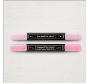
Flirty Flamingo Stampin' Blends Markers Combo Pack 147278