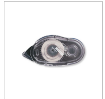
Snail Adhesive 104332