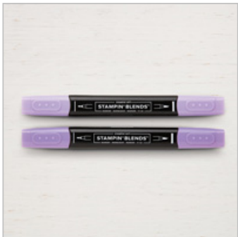
Highland Heather Stampin' Blends Markers Combo Pack 147276