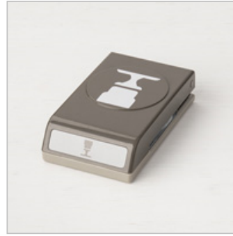
Cake Builder Punch 148525