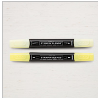
Pineapple Punch Stampin' Blends Markers Combo Pack 147280