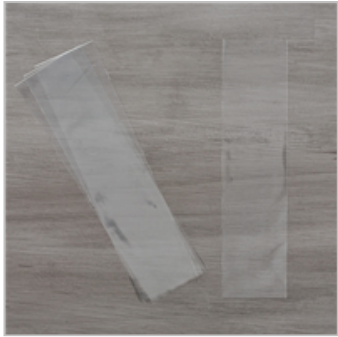
2" X 8" (5.1 X 20.3 Cm) Cellophane Bags