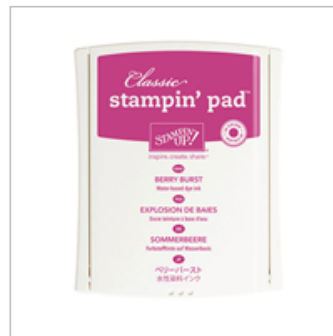
Berry Burst Classic Stampin' Pad