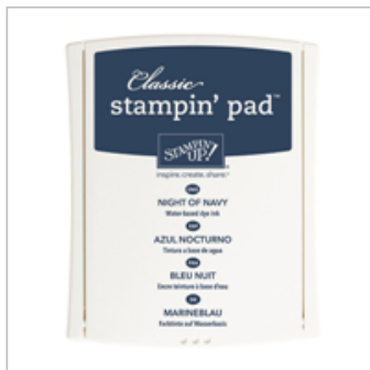
Night Of Navy Classic Stampin' Pad