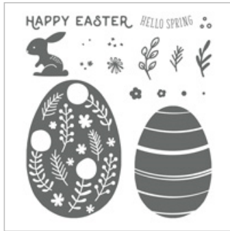
Hello Easter Photopolymer Stamp