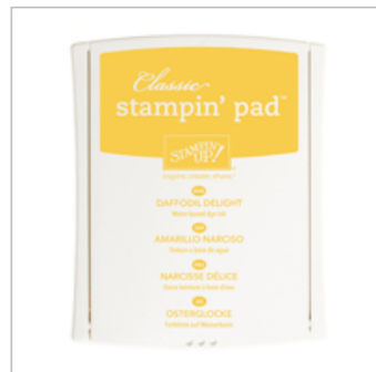
Daffodil Delight Classic Stampin' Pad