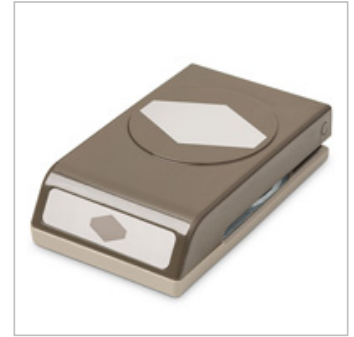
Tailored Tag Punch