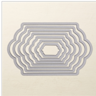
Lots Of Labels Framelits Dies