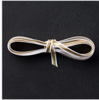
Gold 1/8" (3.2 Mm) Ribbon