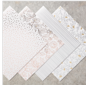
Springtime Foils Specialty Designer