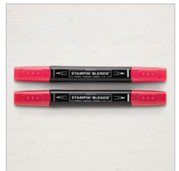
Real Red Combo Pack Stampin' Blends