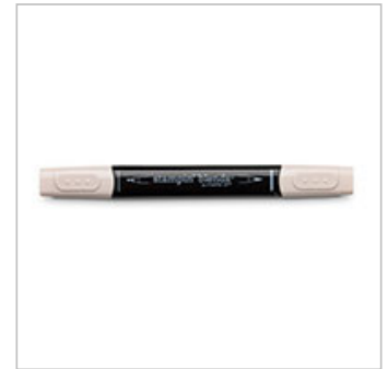
Ivory Stampin' Blends Marker