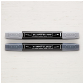
Basic Black Combo Pack Stampin' Blends