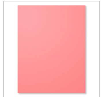
Flirty Flamingo 8-1/2" X 11" Cardstock