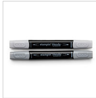
Smoky Slate Stampin' Blends Markers Combo Pack