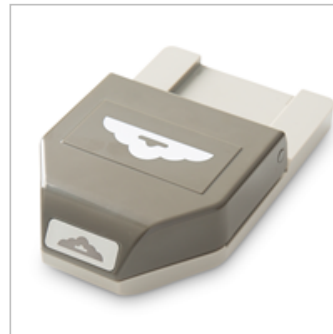
Scalloped Tag Topper Punch