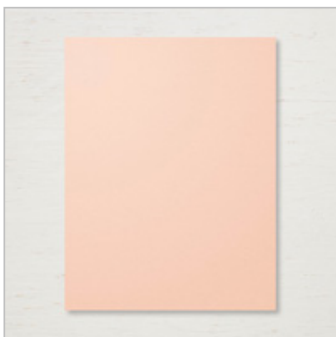
Petal Pink 8-1/2" X 11" Cardstock