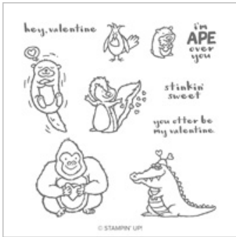
Hey Love Cling Stamp Set