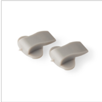
Stampin' Trimmer Scoring Blades