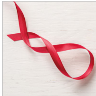
Real Red 3/8" (1 Cm) Mixed Satin Ribbon