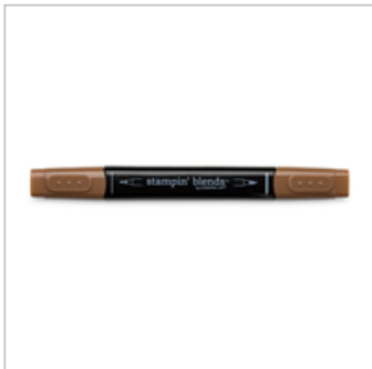
Bronze Stampin' Blends Marker