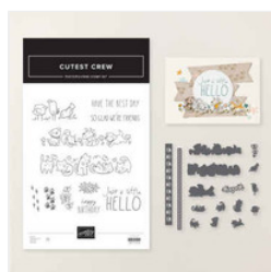
Cutest Crew Bundle (English) - 167149