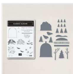
Classic Cloche Bundle (English) - 156786