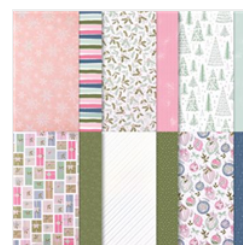
Whimsy & Wonder 12" X 12" (30.5 X 30.5 Cm) Specialty Designer Series Paper - 156329