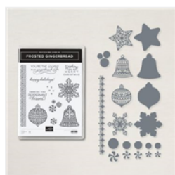
Frosted Gingerbread Bundle (English) - 156807