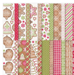
Gingerbread & Peppermint 6" X 6" (15.2 X 15.2 Cm) Designer Series Paper - 156313