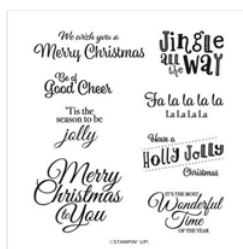
Holly Jolly Wishes Cling Stamp Set (English) - 156362