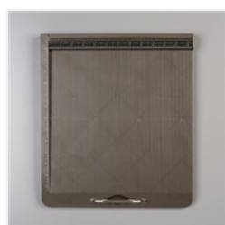
Simply Scored Scoring Tool - 122334