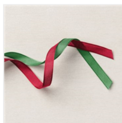
Real Red & Garden Green 3/8" (1 Cm) Ribbon Combo Pack - 159577