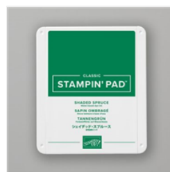
Shaded Spruce Classic Stampin' Pad - 147088