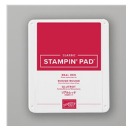
Real Red Classic Stampin' Pad - 147084