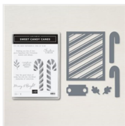
Sweet Candy Canes Bundle (English) - 161052