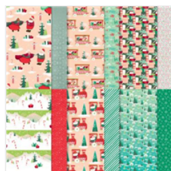
Santa Express 12" X 12" (30.5 X 30.5 Cm) Designer Series Paper - 159582