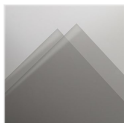
Window Sheets - 142314