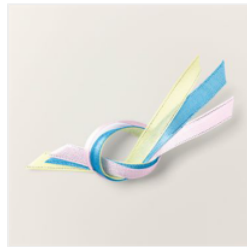
3/8" (1 Cm) Sheer Ribbon Combo Pack - 161635