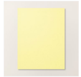
Lemon Lolly 8-1/2" X 11" Cardstock - 161720