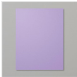
Highland Heather 8-1/2" X 11" Cardstock - 146986