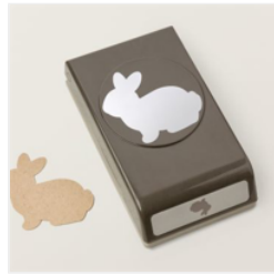
Easter Bunny Punch - 160331