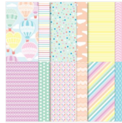
Lighter Than Air 6" X 6" (15.2 X 15.2 Cm) Designer Series Paper - 162747