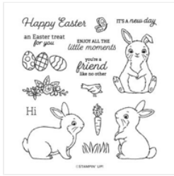
Easter Bunny Photopolymer Stamp Set (English) - 160272

stampingwithamore@gmail.com http://www.stampingwithamore.com