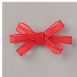
Real Red 3/8" (1 Cm) Sheer Ribbon - 153535