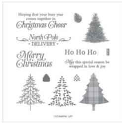
Perfectly Plaid Photopolymer Stamp Set (English) - 158335