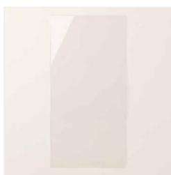
Flat 4" X 8" (10.2 X 20.3 Cm) Cellophane Bags - 167769