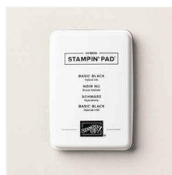
Basic Black Hybrid Stampin' Pad - 166648