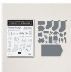
Sweet Little Stockings Bundle (English) - 156798