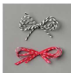
Playful Pets Trim Combo Pack - 152466