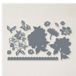
Penned Flowers Dies - 155557