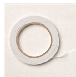
Tear & Tape Adhesive - 154031