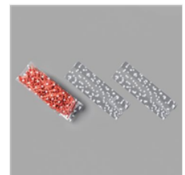
3" X 9" (7.6 X 22.9 Cm) Printed Gusseted Cellophane Bags - 151312