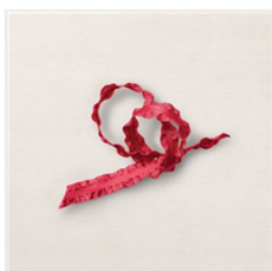
Real Red 3/8" (1 Cm) Mini Ruffled Ribbon - 156323