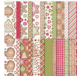
Gingerbread & Peppermint 6" X 6" (15.2 X 15.2 Cm) Designer Series Paper - 156313