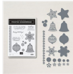
Frosted Gingerbread Bundle (English) - 156807