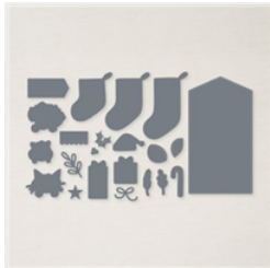
Stockings Dies - 156288