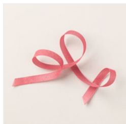
Strawberry Slush 3/8" (1 Cm) Faux Linen Ribbon - 165274