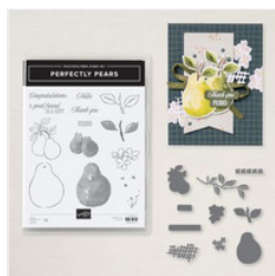
Perfectly Pears Bundle (English) - 166154