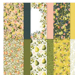
Painterly Pears 12" X 12" (30.5 X 30.5 Cm) Designer Series Paper - 166146