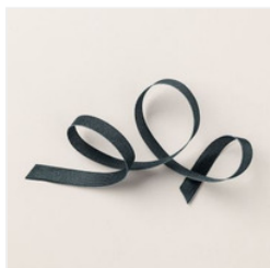
Secret Sea 3/8" (1 Cm) Faux Linen Ribbon - 165273