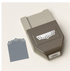
Elegant Edge Tag Topper Punch - 161287