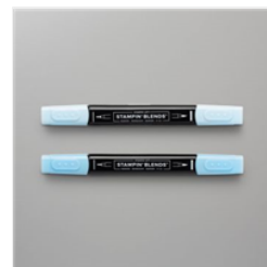
Balmy Blue Stampin' Blends Combo Pack - 154830