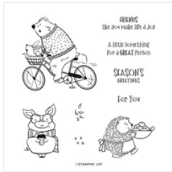
Joyful Life Cling Stamp Set - 156529