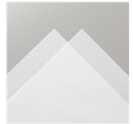
Vellum 8-1/2" X 11" Cardstock - 101856