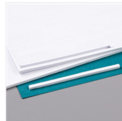
Foam Adhesive Strips - 141825