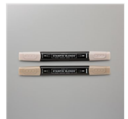
Crumb Cake Stampin' Blends Combo Pack - 154882