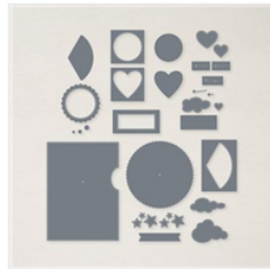
Give It A Whirl Dies - 154336