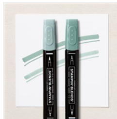
Soft Succulent Stampin' Blends Combo Pack - 155521