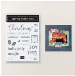
Keeping Traditions Photopolymer Stamp Set (English) - 169229

stampingwithamore@gmail.com http://www.stampingwithamore.com