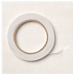
Tear & Tape Adhesive - 154031