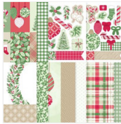
Christmas Tags & More 6" X 6" (15.2 X 15.2 Cm) Mix & Match Specialty Designer Series Paper - 165907