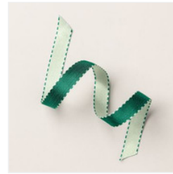
Shaded Spruce & Soft Sea Foam 1/2" (1.3 Cm) Ribbon - 165234