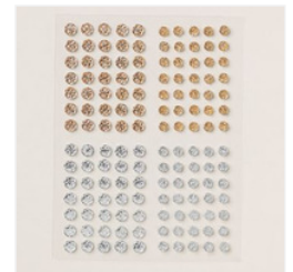
Drusy Adhesive-Backed Embellishments - 164223