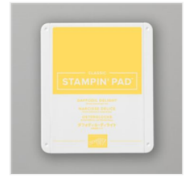
Daffodil Delight Classic Stampin' Pad - 147094