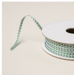
Garden Green 1/8" (3.2 Mm) Chevron Ribbon - 167212