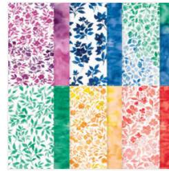
Garden Poetry 12" X 12" (30.5 X 30.5 Cm) Designer Series Paper - 167113