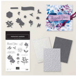
Paradise Garden Bundle (English) - 167121

stampingwithmore@gmail.com http://www.stampingwithmore.com