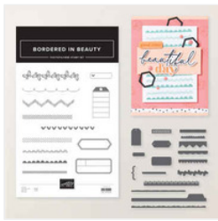
Bordered In Beauty Bundle - 167557

stampingwithamore@gmail.com http://www.stampingwithamore.com