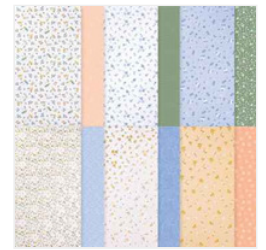
Bloom Boutique 12" X 12" (30.5 X 30.5 Cm) Specialty Designer Series Paper - 167637