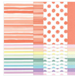
Subtles Painted Patterns 12" X 12" (30.5 X 30.5 Cm) Designer Series Paper - 167758