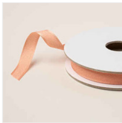
Crisp Cantaloupe 3/8" (1 Cm) Bordered Ribbon - 167552