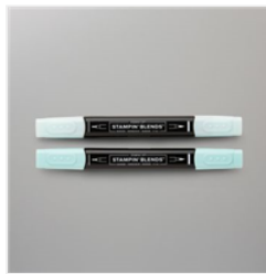
Pool Party Stampin' Blends Combo Pack - 154894