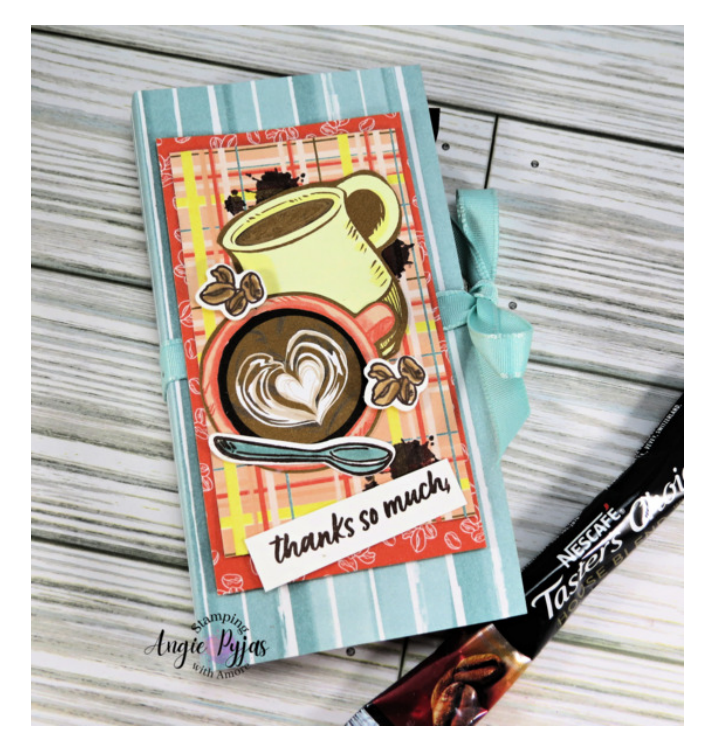
A Little Latte Designer Series Paper for Gift Holder.

Cut one piece for the Outside of the Box 6-3/4" x 5-3/4".