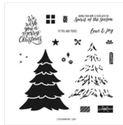
Merriest Trees Photopolymer Stamp Set (English) - 162043