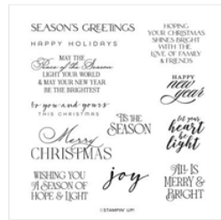
Brightest Glow Cling Stamp Set (English) - 159542