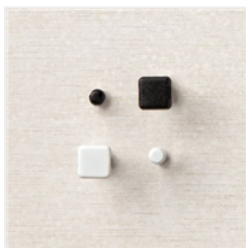
Round & Square Brads - 155570