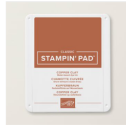
Copper Clay Classic Stampin' Pad - 161647