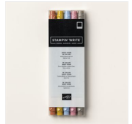
2023-2025 In Color Stampin' Write Markers - 161695