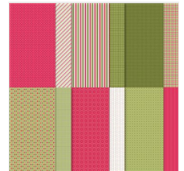
Heartwarming Hugs Designer Series Paper - 153492