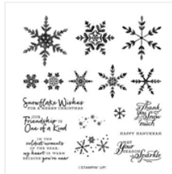
Snowflake Wishes Photopolymer Stamp Set (English) - 158267