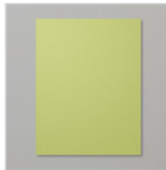
Pear Pizzazz 8-1/2" X 11" Cardstock - 131201