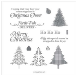
Perfectly Plaid Photopolymer Stamp Set (English) - 158335