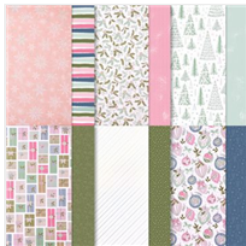
Whimsy & Wonder 12" X 12" (30.5 X 30.5 Cm) Specialty Designer Series Paper - 156329