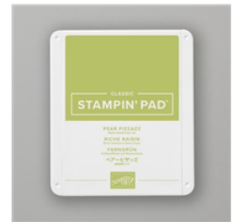
Pear Pizzazz Classic Stampin' Pad - 147104