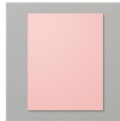
Blushing Bride 8-1/2" X 11" Cardstock - 131198