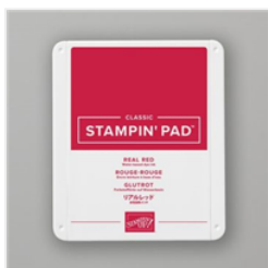
Real Red Classic Stampin' Pad - 147084