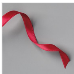
Real Red 3/8" (1 Cm) Double-Stitched Satin Ribbon - 151155