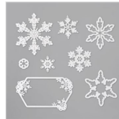
So Many Snowflakes Dies - 153560