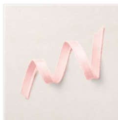
Blushing Bride 3/8" (1 Cm) Frayed Grosgrain Ribbon - 156341