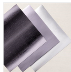
Silver Foil 12" X 12" (30.5 X 30.5 Cm) Specialty Pack - 156457