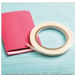
Tear & Tape Adhesive - 138995