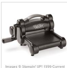
Big Shot - 143263