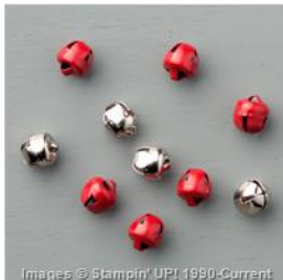
Mini Jingle Bells - 142002