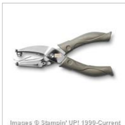
1/8" (3.2 Mm) Circle Punch - 134365