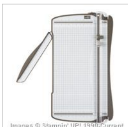
Stampin' Trimmer - 126889