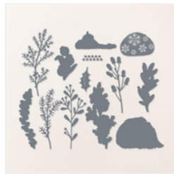
Magical Meadow Dies - 162143