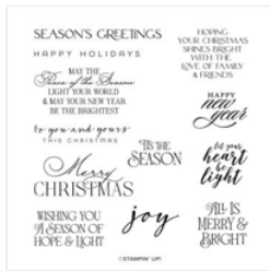
Brightest Glow Cling Stamp Set (English) - 159542

stampingwithamore@gmail.com http://www.stampingwithamore.com