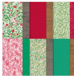
Joy Of Christmas 12" X 12" (30.5 X 30.5 Cm) Designer Series Paper - 161958