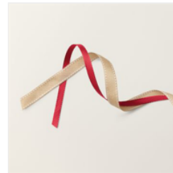
Real Red & Burlap Ribbon Combo Pack - 160386