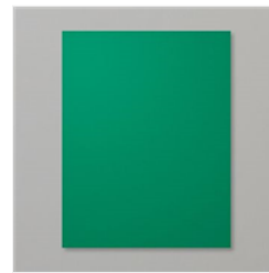
Shaded Spruce 8- 1/2" X 11" Cardstock - 146981