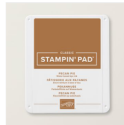
Pecan Pie Classic Stampin' Pad - 161665