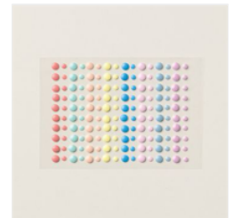
Rainbow Adhesive-Backed Dots - 162758