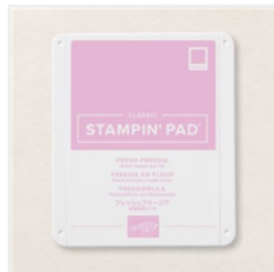
Fresh Freesia Classic Stampin' Pad - 155611