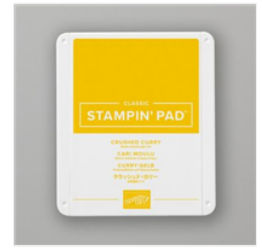
Crushed Curry Classic Stampin' Pad - 147087