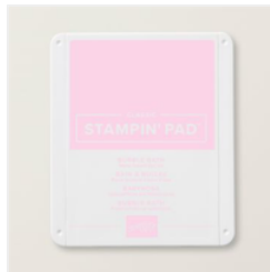
Bubble Bath Classic Stampin' Pad - 161664