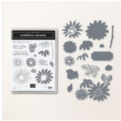
Cheerful Daisies Bundle (English) - 161297

stampingwithmore@gmail.com http://www.stampingwithmore.com