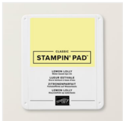
Lemon Lolly Classic Stampin' Pad - 161666