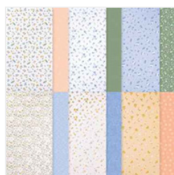
Bloom Boutique 12" X 12" (30.5 X 30.5 Cm) Specialty Designer Series Paper - 167637