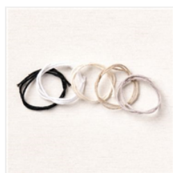
Baker's Twine Essentials Pack - 155475