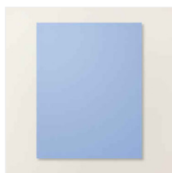
Hydrangea Hue 8-1/2" X 11" Cardstock - 167687