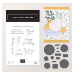
Scalloped Blooms Bundle (English) - 167647