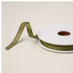
Mossy Meadow & Gold 1/4" (6.4 Mm) - 166158