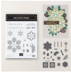
Delicate Pines Bundle (English) - 166074

stampingwithamore@gmail.com http://www.stampingwithamore.com