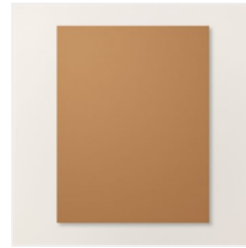
Pecan Pie 8-1/2" X 11" Cardstock - 161717