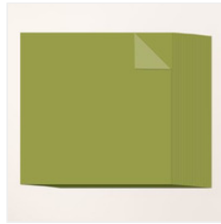
Old Olive 12" X 12" (30.5 X 30.5 Cm) Two-Tone Cardstock - 166683