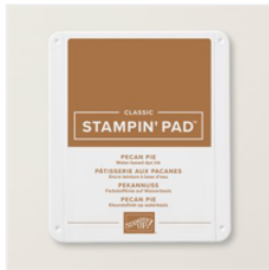
Pecan Pie Classic Stampin' Pad - 161665