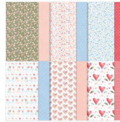
Country Floral Lane 12" X 12" (30.5 X 30.5 Cm) Designer Series Paper - 160375