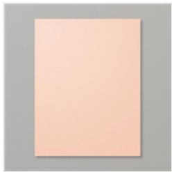
Petal Pink 8-1/2" X 11" Cardstock - 146985