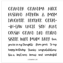
Best Family Ever Photopolymer Stamp Set (English) - 160720