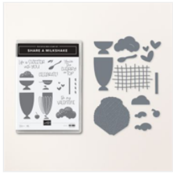
Share A Milkshake Bundle (English) - 160396

stampingwithmore@gmail.com http://www.stampingwithmore.com