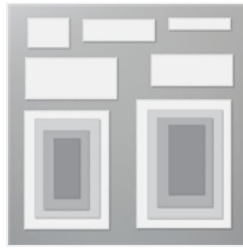
Rectangle Stitched Dies - 151820