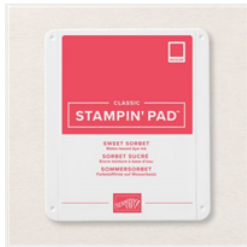
Sweet Sorbet Classic Stampin' Pad - 159216