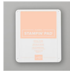
Petal Pink Classic Stampin' Pad - 147108