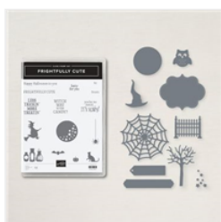
Frightfully Cute Bundle - 156493