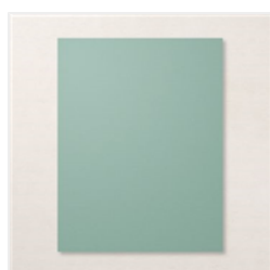
Soft Succulent 8-1/2" X 11" Cardstock - 155776