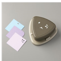
Detailed Trio Punch - 146320