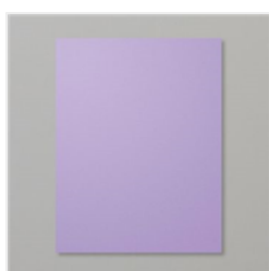
Highland Heather 8-1/2" X 11" Cardstock - 146986