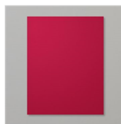
Cherry Cobbler 8-1/2" X 11" Cardstock - 119685