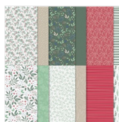
Tidings Of Christmas 6" X 6" (15.2 X 15.2 Cm) Designer Series Paper - 155718