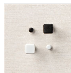
Round & Square Brads - 155570