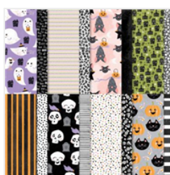
Cute Halloween 6" X 6" (15.2 X 15.2 Cm) Designer Series Paper - 156479