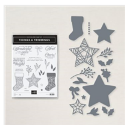
Tidings & Trimmings Bundle (English) - 155716