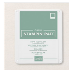
Soft Succulent Classic Stampin' Pad - 155778