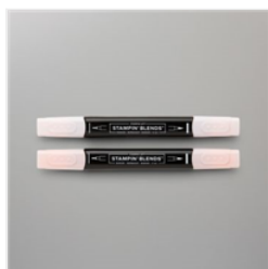
Petal Pink Stampin' Blends Combo Pack - 154893