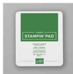
Garden Green Classic Stampin' Pad - 147089