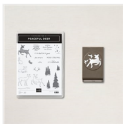
Peaceful Deer Bundle (English) - 156391