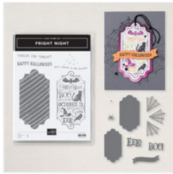
Fright Night Bundle (English) - 166107

stampingwithamore@gmail.com http://www.stampingwithamore.com