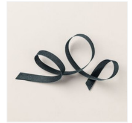
Secret Sea 3/8" (1 Cm) Faux Linen Ribbon - 165273