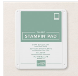
Soft Succulent Classic Stampin' Pad - 155778