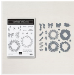
Cottage Wreaths Bundle (English) - 159659