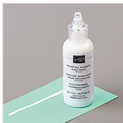
Snowfall Accents Puff Paint - 150691