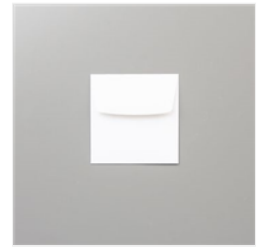
Basic White 3" X 3" (7.6 X 7.6 Cm) Envelopes - 159233