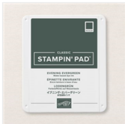
Evening Evergreen Classic Stampin' Pad - 155576