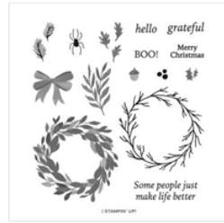
Cottage Wreaths Photopolymer Stamp Set (English) - 159652