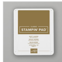
Soft Suede Classic Stampin' Pad - 147115