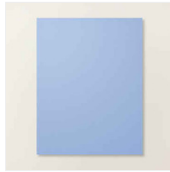
Hydrangea Hue 8-1/2" X 11" Cardstock - 167687