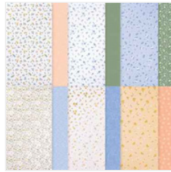
Bloom Boutique 12" X 12" (30.5 X 30.5 Cm) Specialty Designer Series Paper - 167637