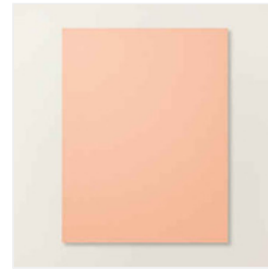
Crisp Cantaloupe 8-1/2" X 11" Cardstock - 167693