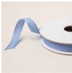
Hydrangea Hue 3/8" (1 Cm) Bordered Ribbon - 167549