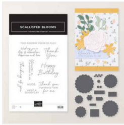
Scalloped Blooms Bundle (English) - 167647

stampingwithmore@gmail.com http://www.stampingwithmore.com