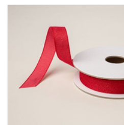
Real Red 1/2" (1.3 Cm) Shiny Ribbon - 165876