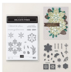
Delicate Pines Bundle (English) - 166074