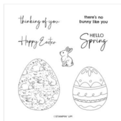
Excellent Eggs Cling Stamp Set (English) - 162801