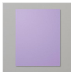
Highland Heather 8-1/2" X 11" Cardstock - 146986