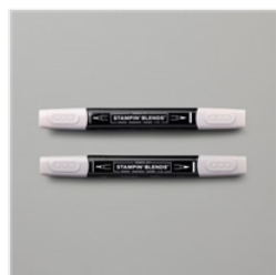
Gray Granite Stampin' Blends Combo Pack - 154886