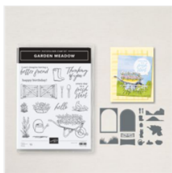
Garden Meadow Bundle (English) - 162741