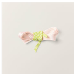
Ribbon Duo Combo Pack - 161318