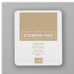
Crumb Cake Classic Stampin' Pad - 147116