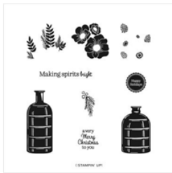
Vintage Christmas Photopolymer Stamp Set (English) - 159781

stampingwithmore@gmail.com http://www.stampingwithmore.com