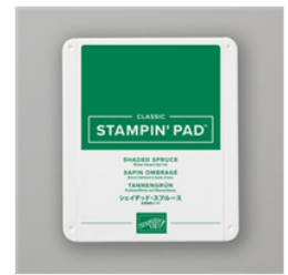
Shaded Spruce Classic Stampin' Pad - 147088