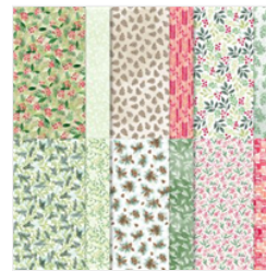
Painted Christmas 12" X 12" (30.5 X 30.5 Cm) Designer Series Paper - 156292