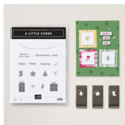
A Little Cheer Bundle (English) - 166124

stampingwithamore@gmail.com http://www.stampingwithamore.com