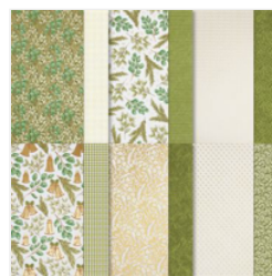
Season Of Green & Gold 12" X 12" (30.5 X 30.5 Cm) Specialty Designer Series Paper - 164324