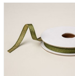
Mossy Meadow & Gold 1/4" (6.4 Mm) - 166158