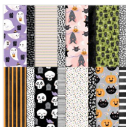
Cute Halloween 6" X 6" (15.2 X 15.2 Cm) Designer Series Paper - 156479