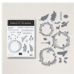
Sparkle Of The Season Bundle (English) - 156765