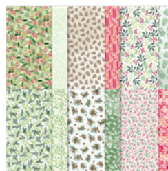
Painted Christmas 12" X 12" (30.5 X 30.5 Cm) Designer Series Paper - 156292