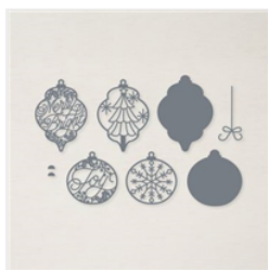
Delicate Baubles Dies - 156383