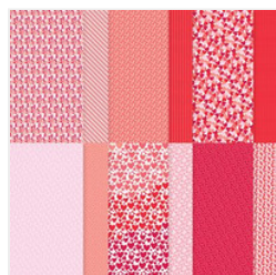
Made With Love 12" X 12" (30.5 X 30.5 Cm) Designer Series Paper - 167054