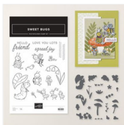
Sweet Bugs Bundle (English) - 167002