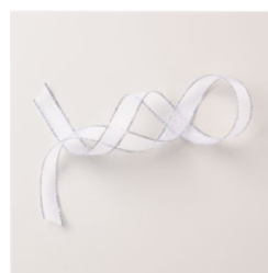
Silver & White 1/2" (1.3 Cm) Sheer Ribbon - 162149