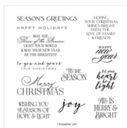
Brightest Glow Cling Stamp Set (English) - 159542