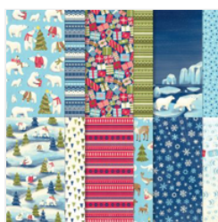
Beary Christmas 12" X 12" (30.5 X 30.5 Cm) Designer Series Paper - 162015