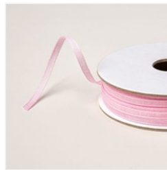
Bubble Bath 1/8" (3.2 Mm) Faux Linen Ribbon - 167075