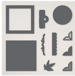
Joyful Squares Dies - 166849