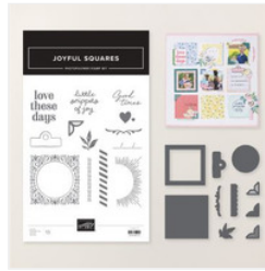
Joyful Squares Bundle (English) - 166850