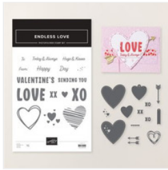
Endless Love Bundle (English) - 167062

stampingwithamore@gmail.com http://www.stampingwithamore.com