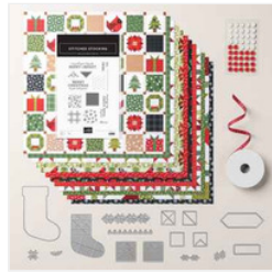
A Stitched Season Suite Collection (English) - 168236