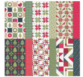
A Stitched Season 12" X 12" (30.5 X 30.5 Cm) Designer Series Paper - 168223