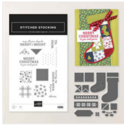
Stitched Stocking Bundle (English) - 168231

stampingwithmore@gmail.com http://www.stampingwithmore.com