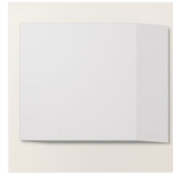
Basic White 12" X 12" (30.5 X 30.5 Cm) Thick Cardstock - 166782