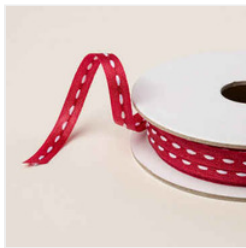
Real Red 1/4" (6.4 Mm) Stitched Ribbon - 168235