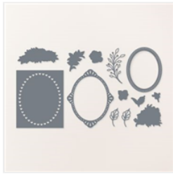
Framed Florets Dies - 160623

stampingwithamore@gmail.com http://www.stampingwithamore.com