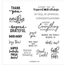
Charming Sentiments Photopolymer Stamp Set (English) - 159985