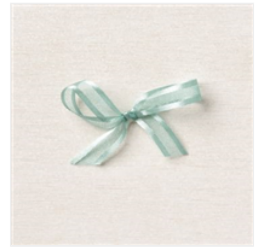
Soft Succulent 3/8" (1 Cm) Open Weave Ribbon - 155780