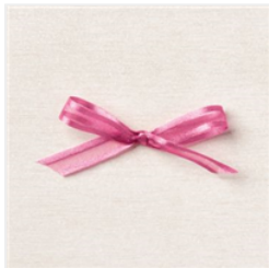
Polished Pink 3/8" (1 Cm) Open Weave Ribbon - 155714