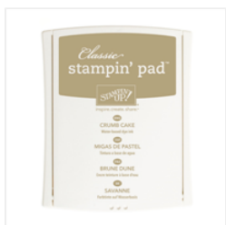
Crumb Cake Classic Stampin' Pad - 126975