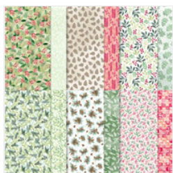
Painted Christmas 12" X 12" (30.5 X 30.5 Cm) Designer Series Paper - 156292