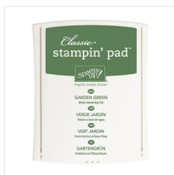
Garden Green Classic Stampin' Pad - 126973