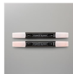
Petal Pink Stampin' Blends Combo Pack - 154893