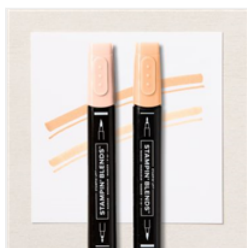
Pale Papaya Stampin' Blends Combo Pack - 155519