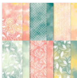
Hello, Irresistible 6" X 6" (15.2 X 15.2 Cm) Designer Series Paper - 161139