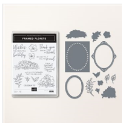
Framed Florets Bundle (English) - 162407