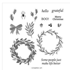
Cottage Wreaths Photopolymer Stamp Set (English) - 159652