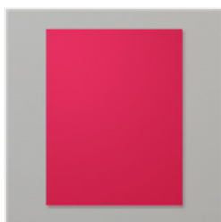
Real Red 8-1/2" X 11" Cardstock - 102482