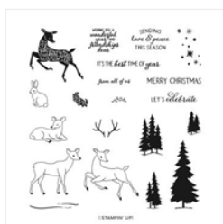
Peaceful Deer Photopolymer Stamp Set (English) - 156891