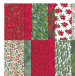
Boughs Of Holly 12" X 12" (30.5 X 30.5 Cm) Designer Series Paper - 159600