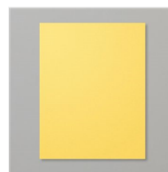
Daffodil Delight 8- 1/2" X 11" Cardstock - 119683