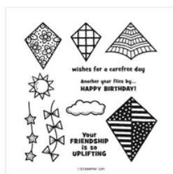
Kite Delight Photopolymer Stamp Set - 157748