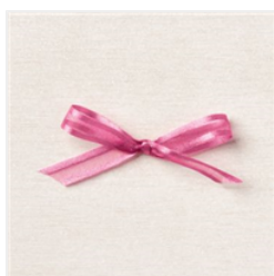
Polished Pink 3/8" (1 Cm) Open Weave Ribbon - 155714