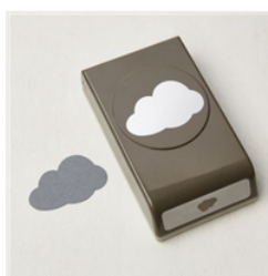
Cloud Punch - 157749