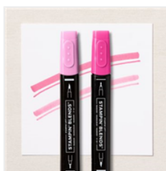
Polished Pink Stampin' Blends Combo Pack - 155520