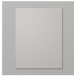
Gray Granite 8-1/2" X 11" Cardstock - 146983