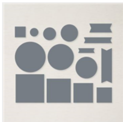
Stylish Shapes Dies - 159183