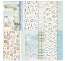
Waterside Retreat 12" X 12" (30.5 X 30.5 Cm) Designer Series Paper - 167920