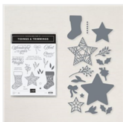
Tidings & Trimmings Bundle (English) - 155716