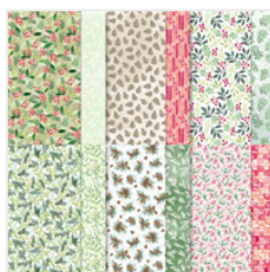
Painted Christmas 12" X 12" (30.5 X 30.5 Cm) Designer Series Paper - 156292