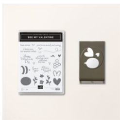
Bee My Valentine Bundle (English) - 162554