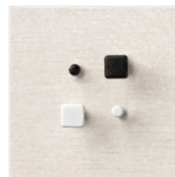
Round & Square Brads - 155570