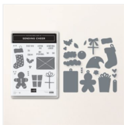
Sending Cheer Bundle (English) - 162053