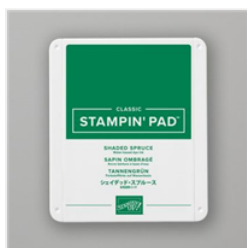
Shaded Spruce Classic Stampin' Pad - 147088