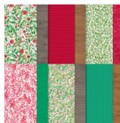
Joy Of Christmas 12" X 12" (30.5 X 30.5 Cm) Designer Series Paper - 161958