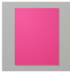
Melon Mambo 8-1/2" X 11" Cardstock - 115320