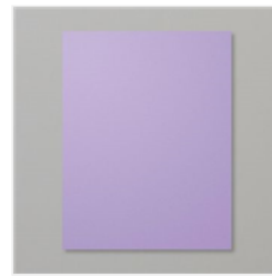
Highland Heather 8-1/2" X 11" Cardstock - 146986