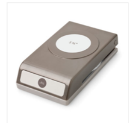
1-3/4" (4.4 Cm) Circle Punch - 119850