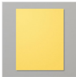
Daffodil Delight 8-1/2" X 11" Cardstock - 119683