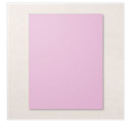
Fresh Freesia 8-1/2" X 11" Cardstock - 155613